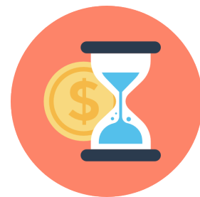
Enhancing Operational Efficiencies